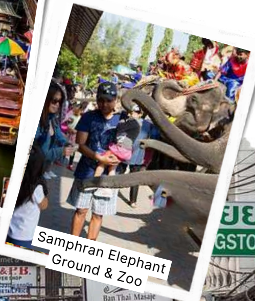
Samphran Elephant Ground & Zoo