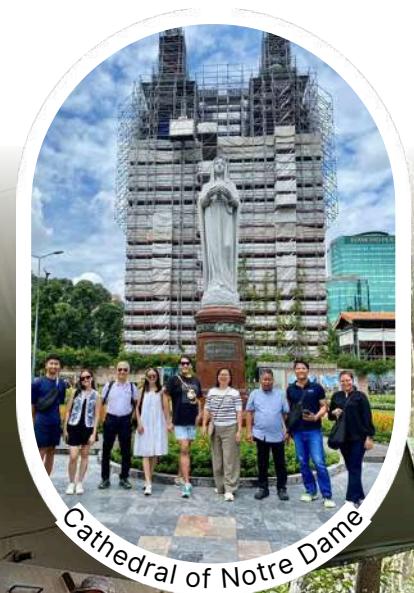
Cathedral of Notre Dame