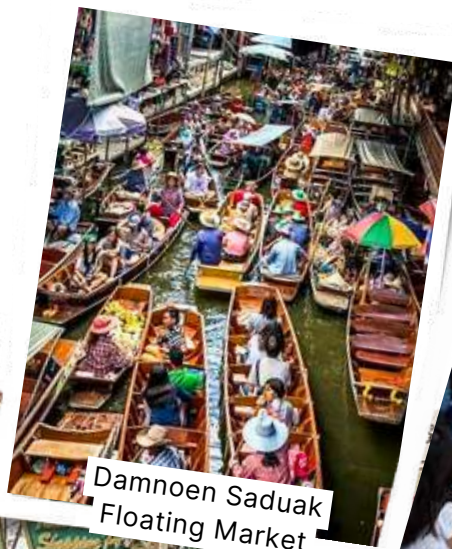
Damnoen Saduak Floating Market